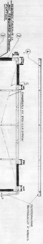
ITEM NO 1