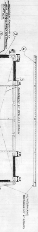
ITEM NO 1