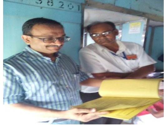
Inspection of Train No. 11463 by ADRM/BPL