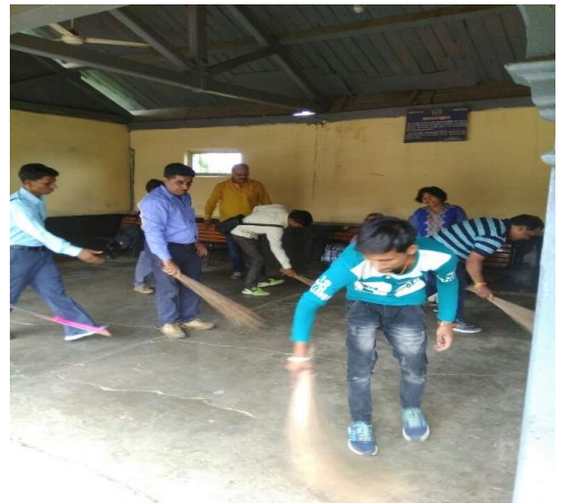
Cleanliness drive at Timarni Station