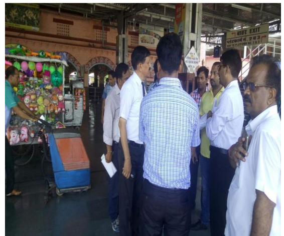
Inspection of Kota Station by CRSE/WCR