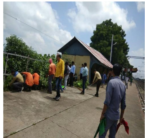
Inspection of Timarni Station by DEE/TRO BPL