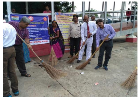
Cleanliness drive at Pipariya Station