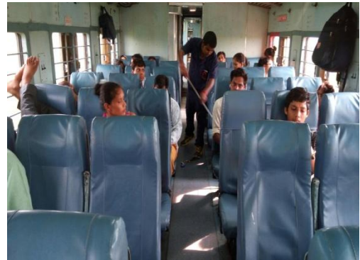
Inspection of Train No. 12060 by CMM/WCR