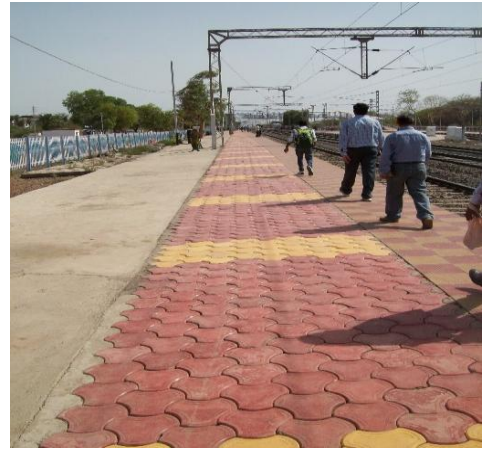
Inspection of Mandi Banmora Station by Sr.DSO/BPL